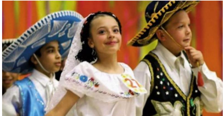
Hondo Fiesta Dancers, a ballet folklorico group

she has collected from past Hondo Fiestas. She also plans to use the binding machine to create teacher handbooks, which she noted was a much faster and more permanent system than plastic ring binding.